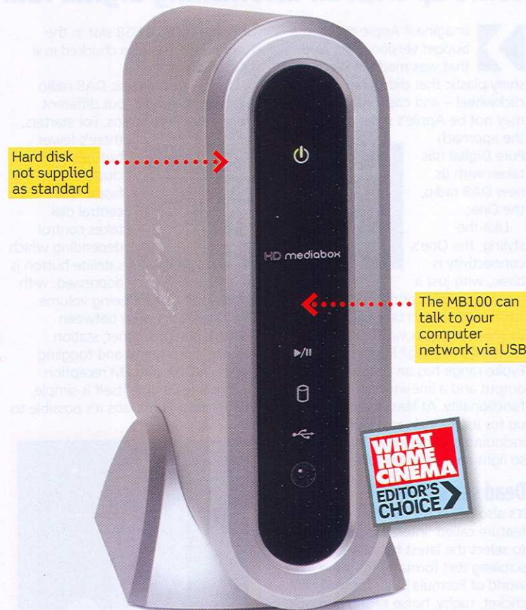
Hard disk not supplied as standard